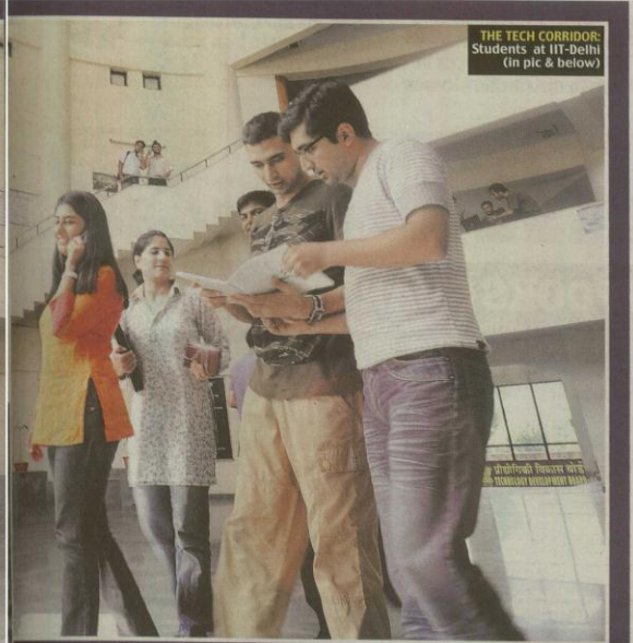
THE TECH CORRIDORS: Students at IIT-Delhi (In pic & below)